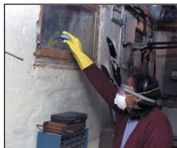
Cleaning while wearing N-95 respirator, gloves, and goggles.

■ Wear goggles. Goggles that do not have ventilation holes are recommended. Avoid getting mold or mold spores in your eyes.