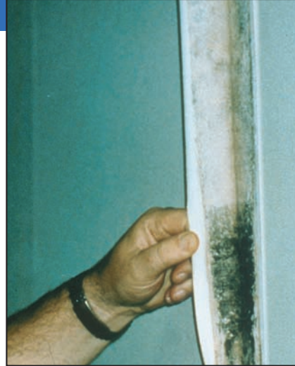
Mold growing on the back side of wallpaper.

Suspicion of hidden mold You may suspect hidden mold if a building smells moldy, but you cannot see the source, or if you know there has been water damage and residents are reporting health problems. Mold may be hidden in places such as the back side of dry wall, wallpaper, or paneling, the top side of ceiling tiles, the underside of carpets and pads, etc. Other possible locations of hidden mold include areas inside walls around pipes (with leaking or condensing pipes), the surface of walls behind furniture (where condensation forms), inside ductwork, and in roof materials above ceiling tiles (due to roof leaks or insufficient insulation).