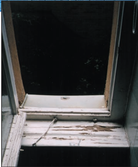
Leaky window – mold is beginning to rot the wooden frame and windowsill.

If you already have a mold problem – ACT QUICKLY. Mold damages what it grows on. The longer it grows, the more damage it can cause.