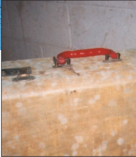
Mold growing on a suitcase stored in a humid basement.

It is important to take precautions to LIMIT YOUR EXPOSURE to mold and mold spores.