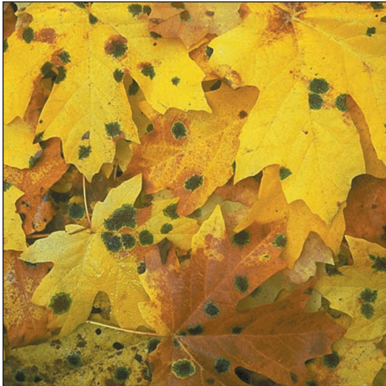
Mold growing on fallen leaves.

This document is available on the Environmental Protection Agency, Indoor Environments Division website at: www.epa.gov/mold