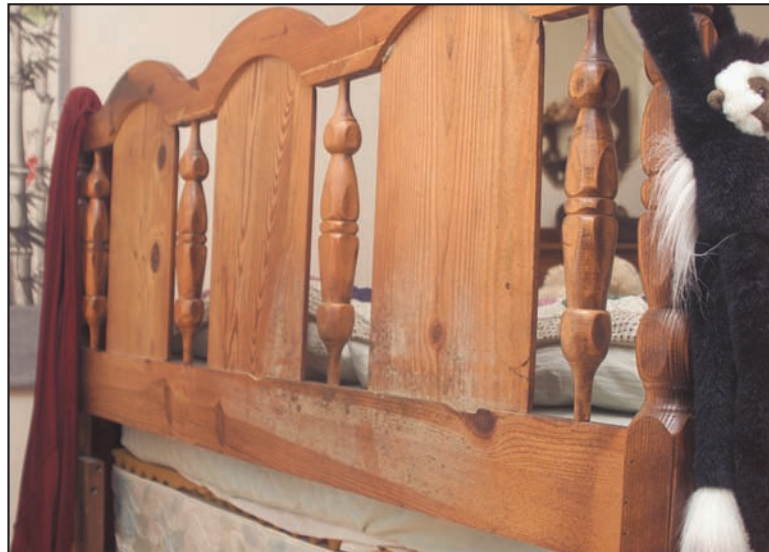
Mold growing on a wooden headboard in a room with high humidity.