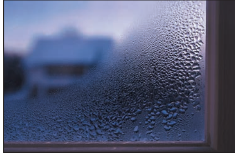
Condensation on the inside of a window-pane.

■ Keep indoor humidity low. If possible, keep indoor humidity below 60 percent (ideally between 30 and 50 percent) relative humidity. Relative humidity can be measured with a moisture or humidity meter, a small, inexpensive ($10-$50) instrument available at many hardware stores.