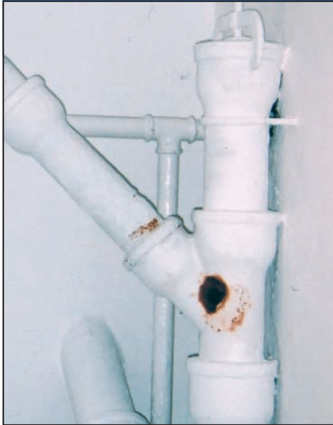
Rust is an indicator that condensation occurs on this drainpipe. The pipe should be insulated to prevent condensation.

Renters: Report all plumbing leaks and moisture problems immediately to your building owner, manager, or superintendent. In cases where persistent water problems are not addressed, you may want to contact local, state, or federal health or housing authorities.