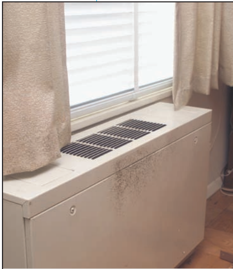
Mold growing on the surface of a unit ventilator.