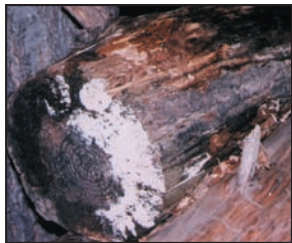
Mold growing outdoors on firewood. Molds come in many colors; both white and black molds are shown here.

Why is mold growing in my home? Molds are part of the natural environment. Outdoors, molds play a part in nature by breaking down dead organic matter such as fallen leaves and dead trees, but indoors, mold growth should be avoided. Molds reproduce by means of tiny spores; the spores are invisible to the naked eye and float through outdoor and indoor air. Mold may begin growing indoors when mold spores land on surfaces that are wet. There are many types of mold, and none of them will grow without water or moisture.